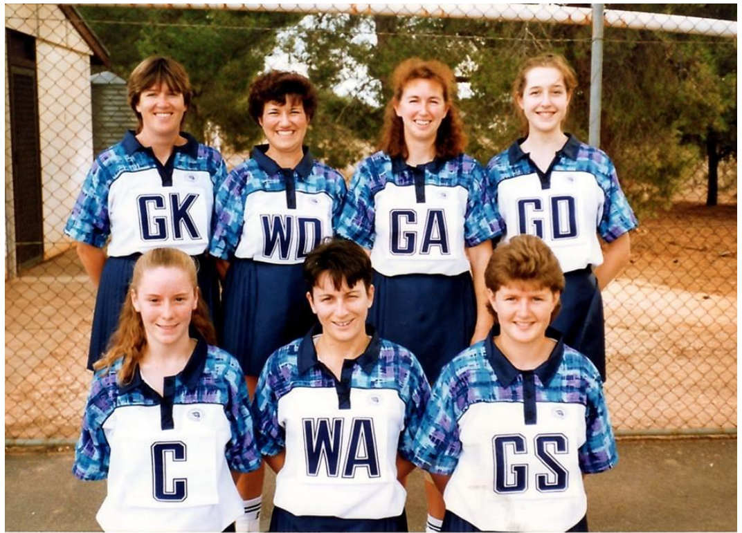
Netty Trip 2009 – Victor Harbor