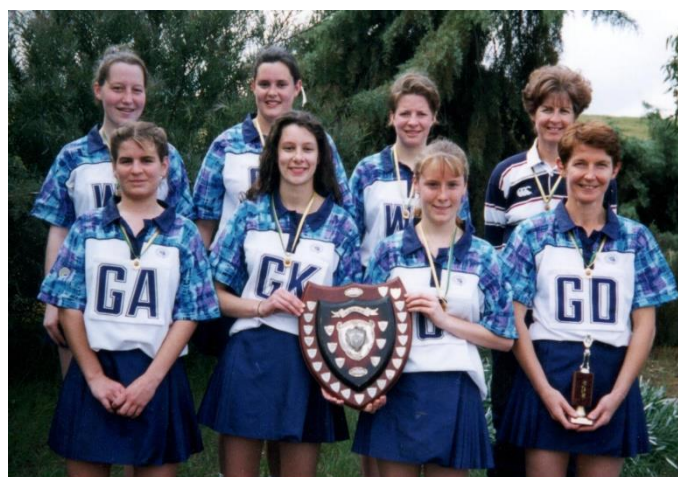
A2 PREMIERS 1995 BLYTH/SNOWTOWN NETBALL CLUB