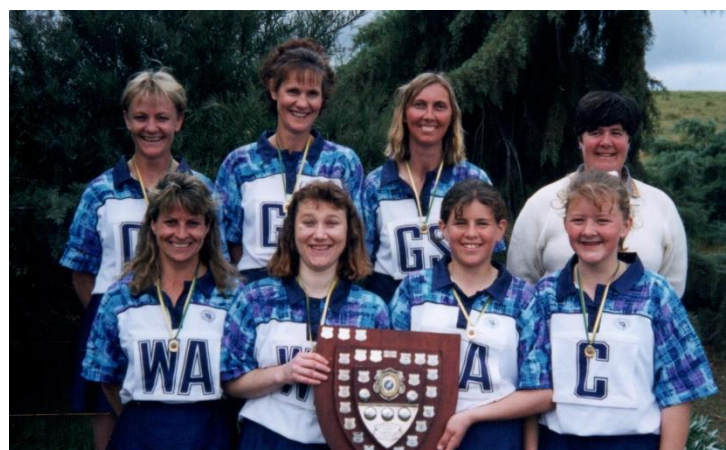
B1 PREMIERS 1995 BLYTH/SNOWTOWN NETBALL CLUB