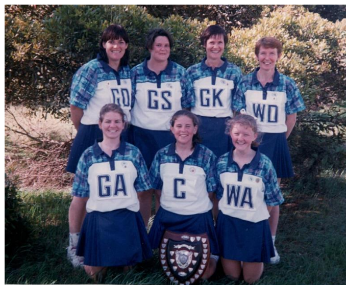
BLYTH/SNOWTOWN NETBALL CLUB