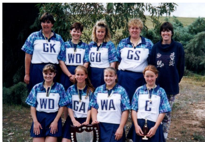
B2 PREMIERS 1995 BLYTH/SNOWTOWN NETBALL CLUB