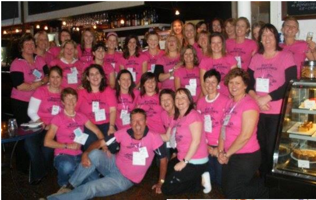
Some of our little Catters – many now senior netballers!